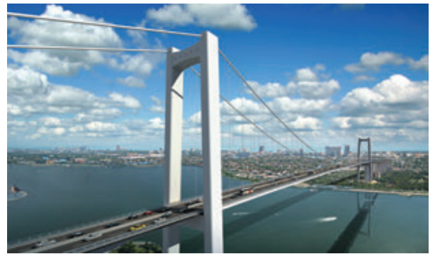
An impression of the Maputo Bridge and Link Roads Project in Mozambique, the largest suspension bridge in Africa