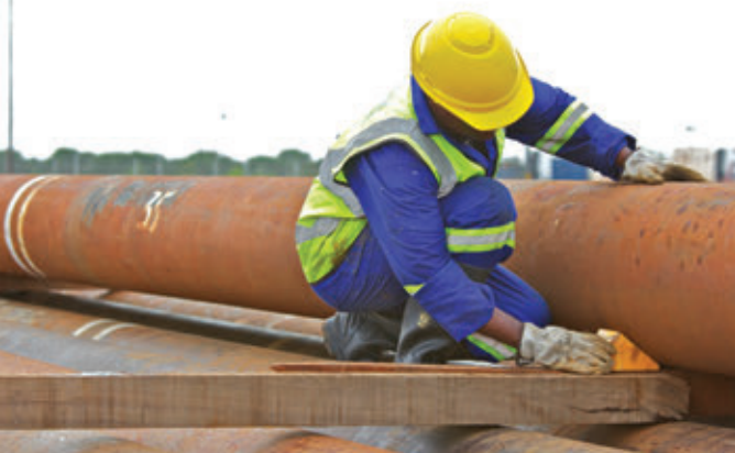
Competing energy companies, Anadarko and Eni, have jointly agreed to develop a LNG Park in northern Mozambique

On completion of the dam – as well as a pumping station, to be located some 13 km downstream – water will flow almost 9 km through a 1,100 mm steel pipe, to reach a reservoir with a capacity of 857 million m 3 . Once the water starts to flow, it is expected to take around two years to fill the reservoir, which will have a surface area of close to 40 km 2 .