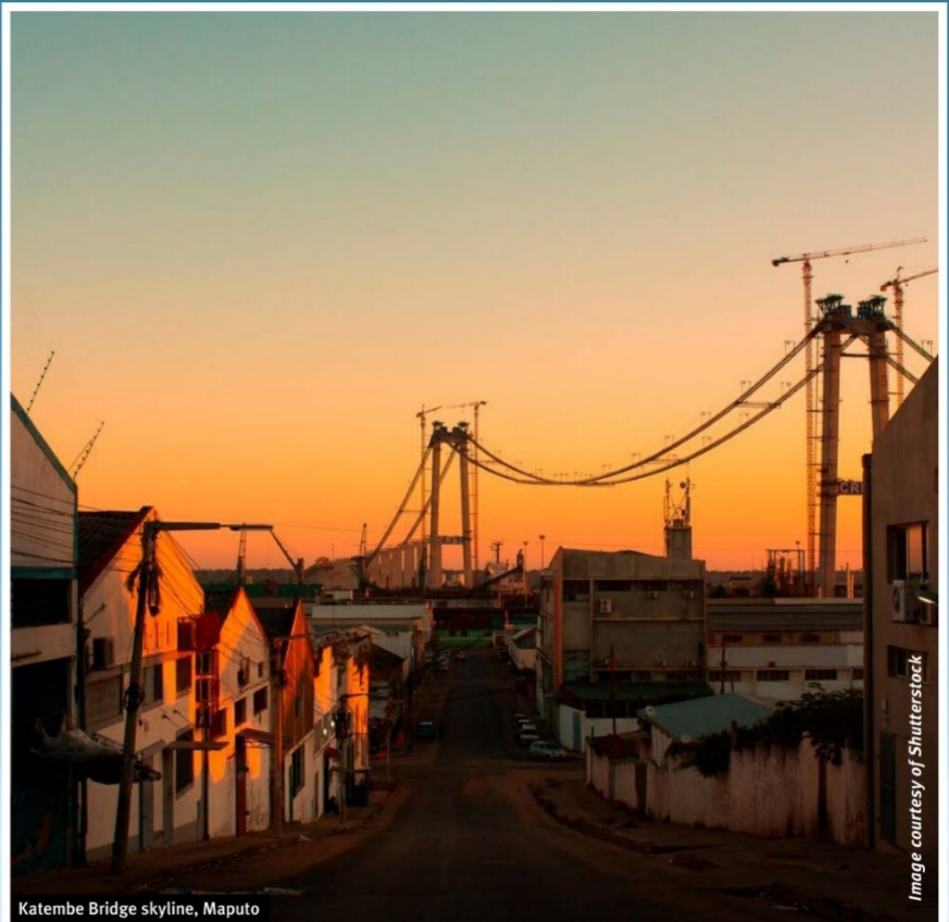
Katembe Bridge skyline, Maputo