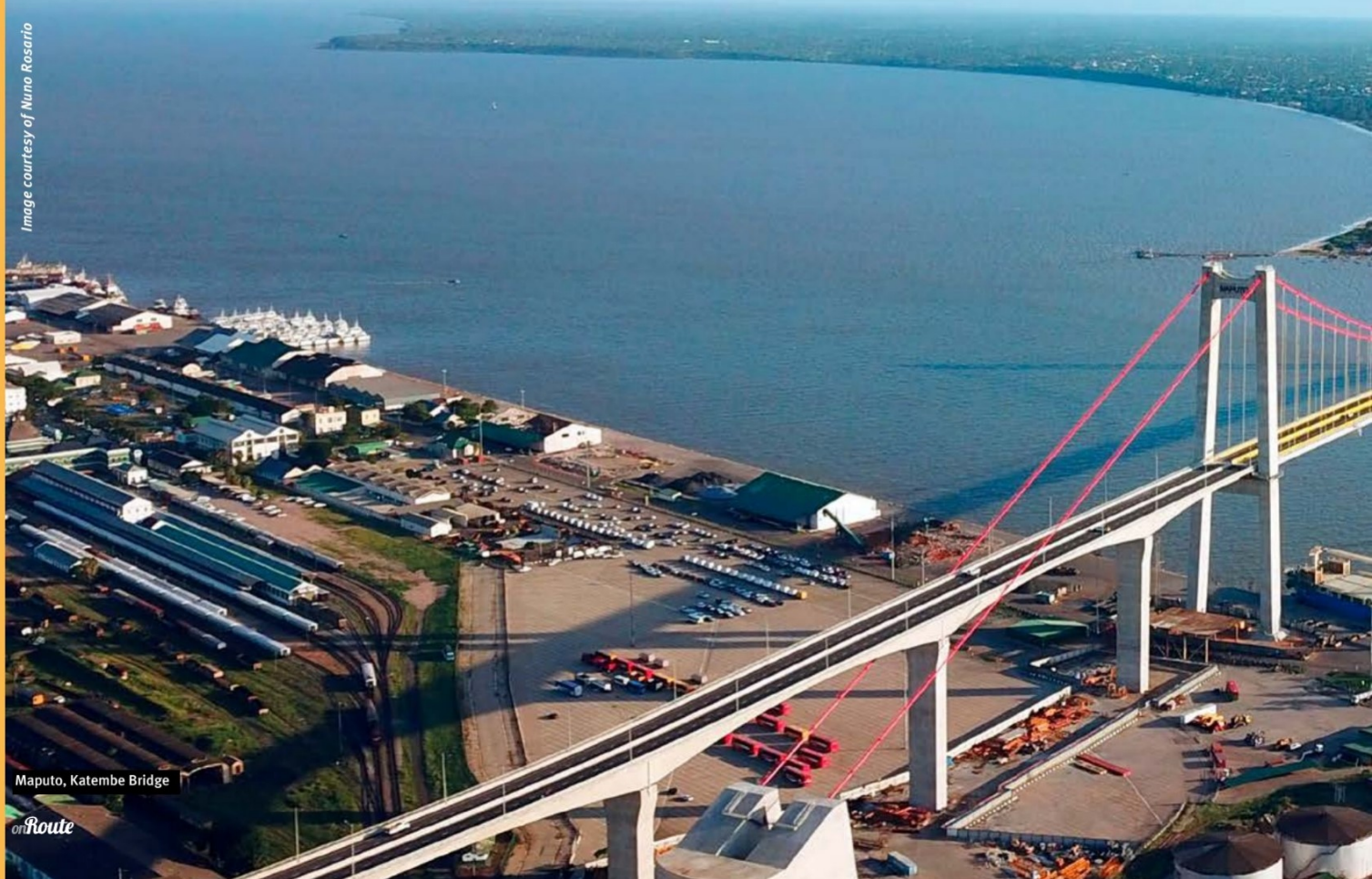
Maputo, Katembe Bridge